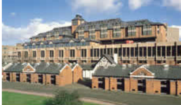
View of hotel and surrounding area from the racecourse

Sundays at the Moat House Hotel (shortly to be CROWNE PLAZA) Malpas Suite, Trinity Street, Chester, CH1 2BD at 11.00 (including New Years Day)